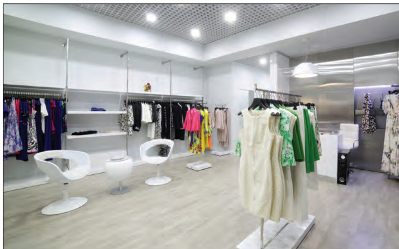
Small- and medium-sized business customers can work with Xcel Energy’s Business Solutions Center at 1.800.481.4700 on energy efficiency projects.