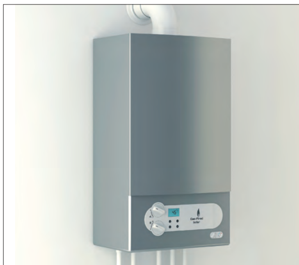
Xcel Energy launched a special flood victims program in 2013 to help those affected by the disaster replace damaged equipment with better technology, including high efficiency water heaters.