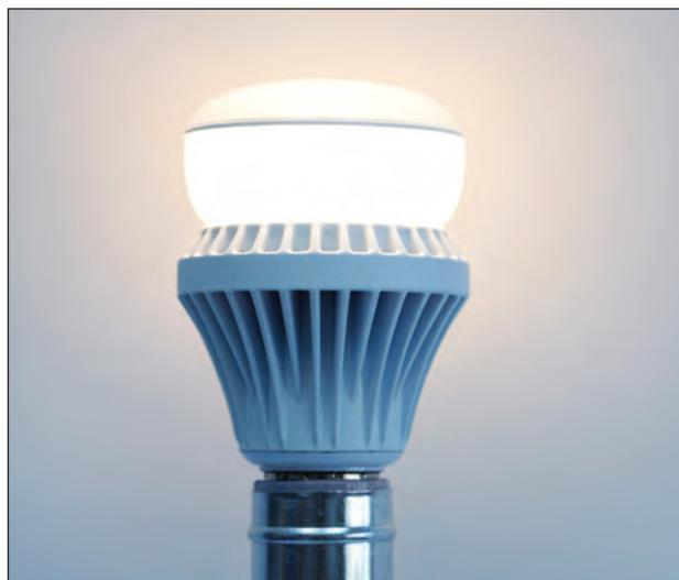
Xcel Energy has partnered with a variety of retailers to help you light up your home for less with discounted LED bulbs.

Customers are taking advantage of Xcel Energy's solutions in large numbers and have expressed satisfaction with their ability to make their own energy decisions. Each year, more than 500,000 customers in Colorado participate.