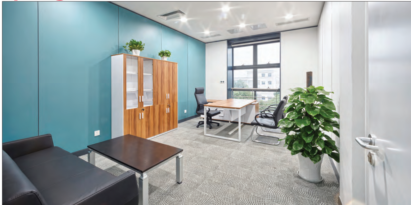
Last year, the average on-site energy audit from Xcel Energy at Colorado businesses identified $5,497 in annual energy savings.